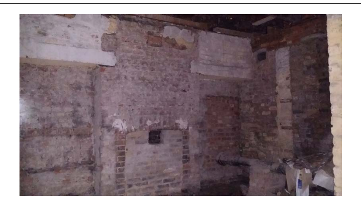
Basement of 28 Blomfield Villas (indicative of the size/state of all the basement spaces to be turned into 3 bedroom flats)