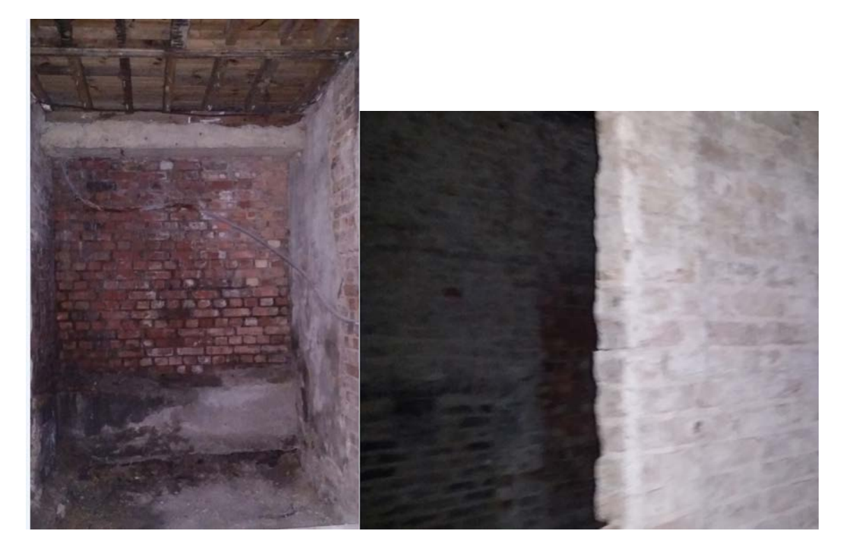
Basement of 32 Blomfield Villas (indicative of the size/state of all the basement spaces to be turned into 3 bedroom flats)